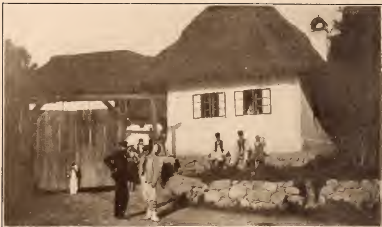
Before he emigrated